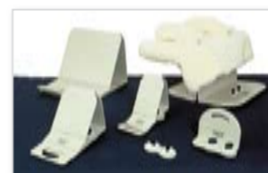
Vast range of support options

Can be fitted to a profile bed if required