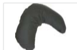
support cushion option available