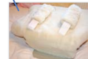
Side Lying Table

Available in different sizes and adjustable in both height and angle the side lying leg support solves a complex problem with minimum fuss. For more active users, the top of the support is slotted so that soft straps can be added to the system to help guide the position of the leg.