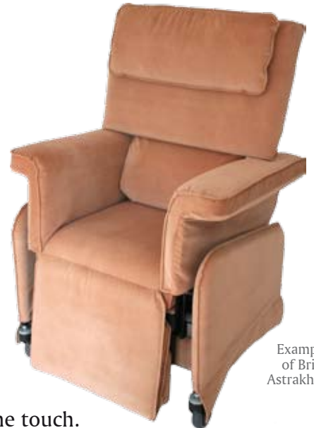
Example of Brick Astrakhan

Our range of Eclipse fabrics are fire retardant, have high standards in durability and stain resistance and are available in a range of colours to suit your requirements.