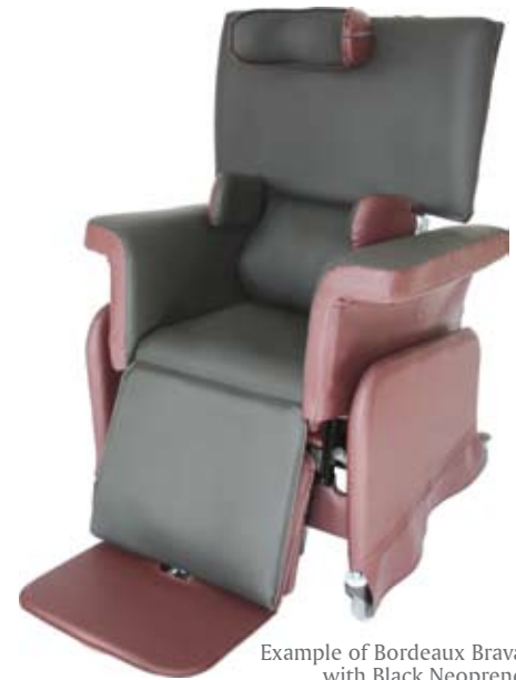
Example of Bordeaux Brava with Black Neoprene

PERMABLOK3® is a proven vinyl protective coating that has been designed to create a tough, effective barrier against three major problems in the education, healthcare and hospitality environments – germs, abrasion and stains. PERMABLOK3® not only guards against stains, abrasion damage and the surface growth of fungus, mould and mildew spores – it also provides superior antimicrobial and antibacterial protection by resisting gram negative and gram positive bacteria (including MRSA), filamentous fungi and yeast.