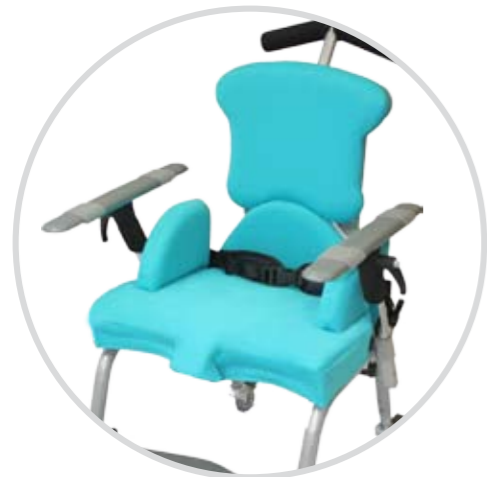
Stirata - Turquoise

All JCM fabrics are fire retardant and have high standards in durability and stain resistance. If you require any further assistance our national team of representatives are always on hand.