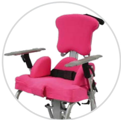
Stirata - Hot Pink