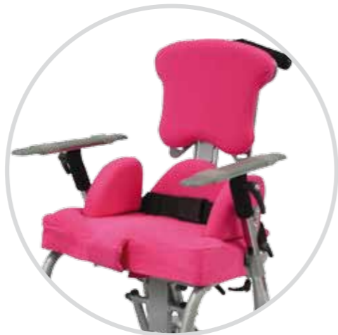
Stirata - Hot Pink