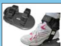
Sandals or Ankle Supports