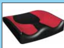
Contoured Seat Cushion