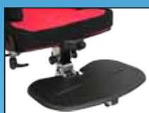
Footplate & Leg Rest